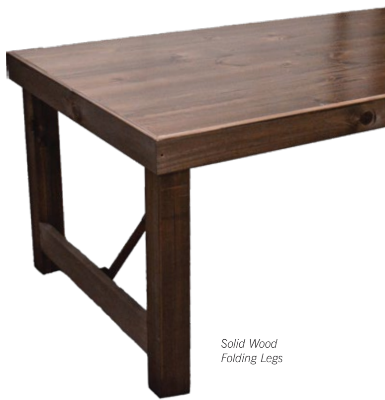
Solid Wood Folding Legs