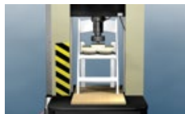
THOROUGHLY TESTED* by an independent lab and passed with a 300lb dynamic and 2000lb static load capacity.