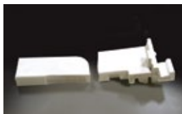
STATE-OF-THE-ART bi-component molded construction for exceptional strength.