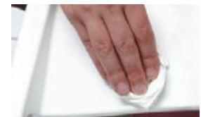
EFFORTLESS maintenance as Classic Event chairs clean easily.