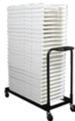
CAPACITY 25 Chairs DIMENSIONS 46"L x 20"W x 60.25"H