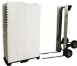
CAPACITY 25 Chairs DIMENSIONS 29"W x 60"H