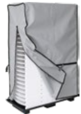
Transport and store your Classic Event Chairs with protective heavy-duty vinyl covers.