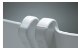
STREAMLINED 2-part molding avoids unsightly seams.