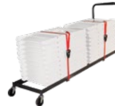
CAPACITY 50 Chairs DIMENSIONS 90"L x 20"W x 60.25"H