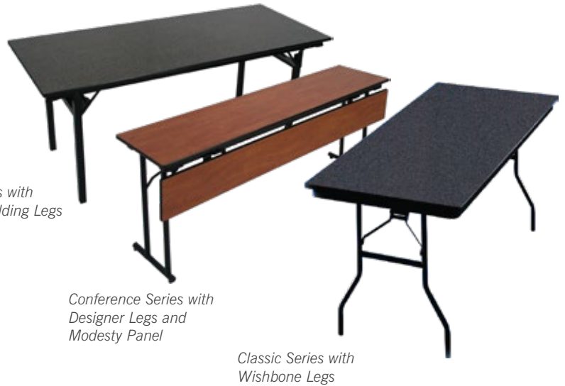
600 Series with Square Folding Legs

Our Laminate Top Folding Tables offer a versatile solution for meeting room space. Made with a rugged plywood core, patented corners and a variety of three leg styles to choose from, our Laminate Top Folding Tables are made to be easily moved, stacked and stored.